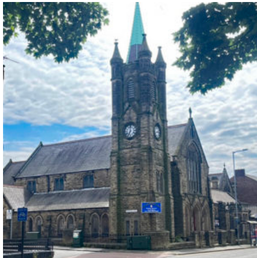
Thornhill Methodist Church, Sunderland,