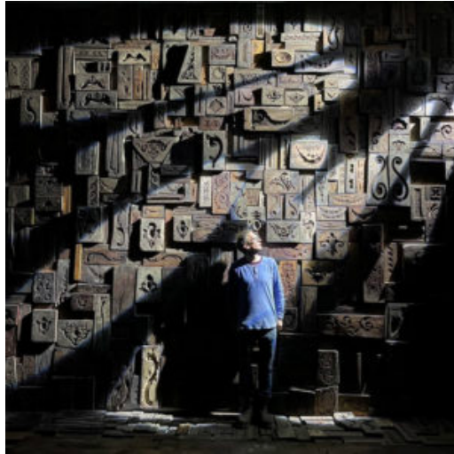
The Tucker Collection of frame-makers' moulds