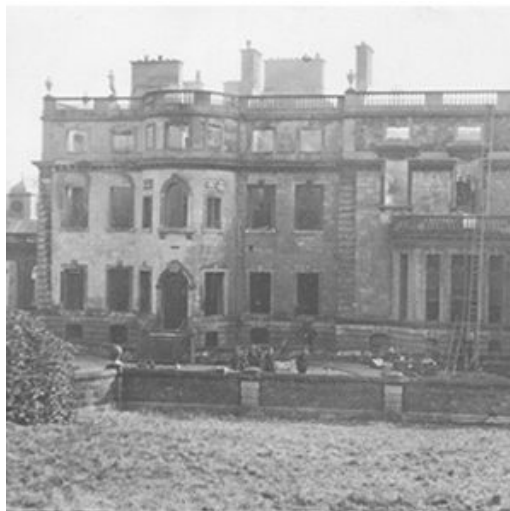
Tehidy house after the 1919 fire - the plaques can be seen either side of the first floor arched window.