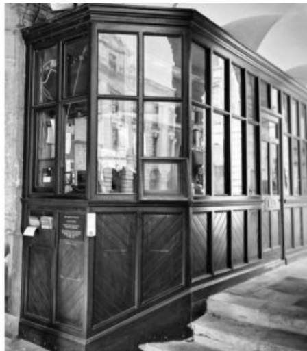
Oxford University Porters' Lodge

The Queen's College curtain wall fronts The High Street and the Porters' Lodge was found built along the inside of it, immediately on the left on entering the main gate. It looked out across the lawned quadrangle through the stone arches. The canted end with a sliding glass hatch incorporated the steps as the descend to the High Street pavement and a busy bus stop. The lean-to building has been removed in order to restore the stone arcade to its full width as originally intended. It now leads to the new beautifully appointed Porters' Lodge behind glass doors in the corner of the quad. The Porter's facilities have been much improved – including The Pidge. We have retained an envelope containing the names of the last incumbants to have a named pigeon hole before the Porter's Lodge was demolished.