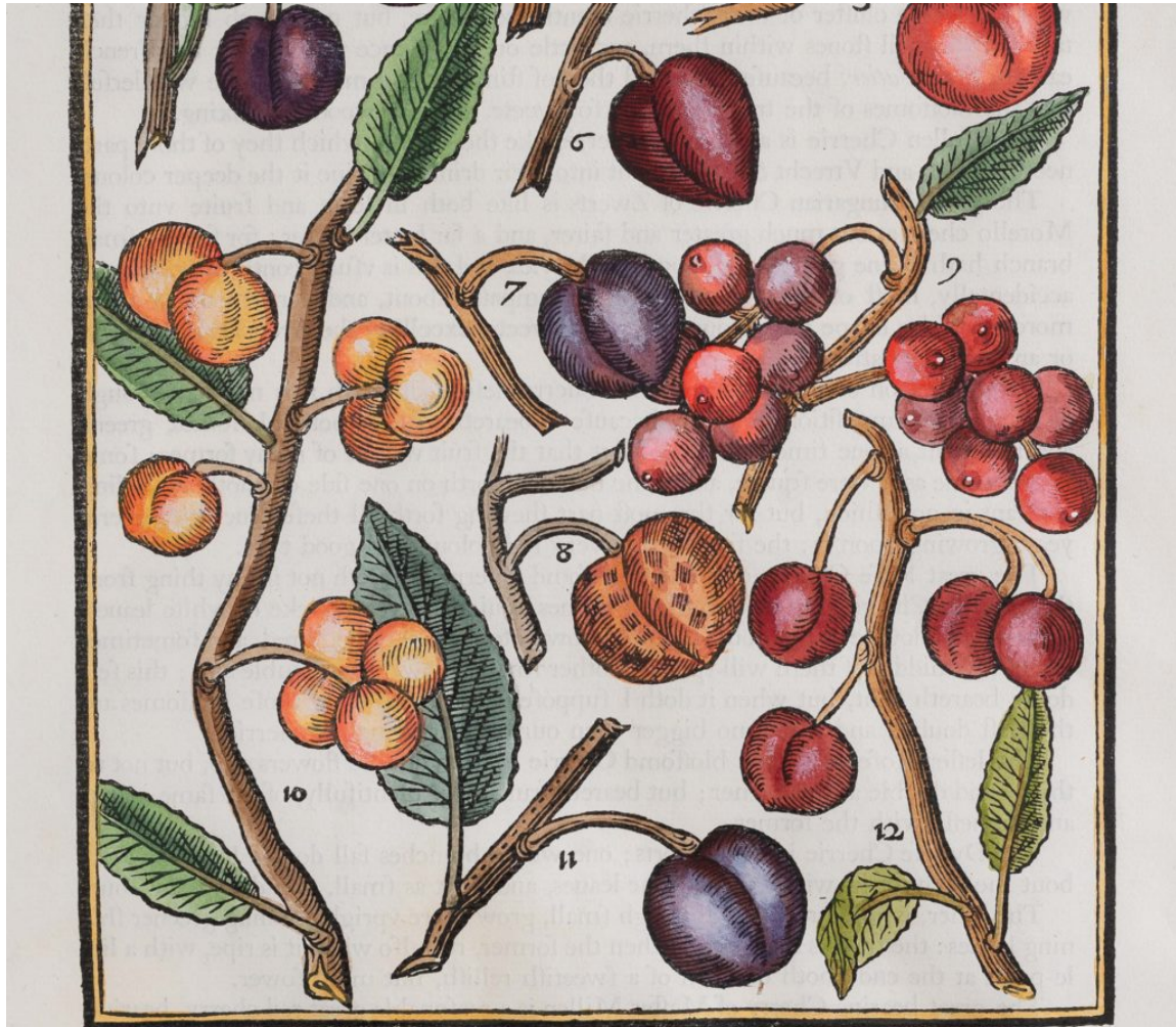
1 Cerasus praecox . The May Cherry. 2 Cerasus Batavica . The Flanders Cherry. 3 Cerasus Hispanica sine alba . The white Cherry. 4 Cerasus platophyllos . The great leaved Cherry. 5 Cerasus Luca Wardi . Luke Wards Cherry. 6 Cerasus Neapolitana . The Naples Cherry. 7 Cerasus Cordata . The Heart Cherry. 8 Cerasus maculata . The bignarre or spotted Cherry. 9 Cerasus avium racemosa . The wilde cluster Cherry. 10 Cerasus Corymbifera . The Flanders cluster Cherry. 11 Cerasus Archiducis . The Archdukes Cherry. 12 Chamaecerasus . The dwarfe Cherry.

BRUNSWICK HOUSE 30 Wandsworth Road, London SW8 2LG +44 (0) 20 7394 2100 brunswick@lassco.co.uk