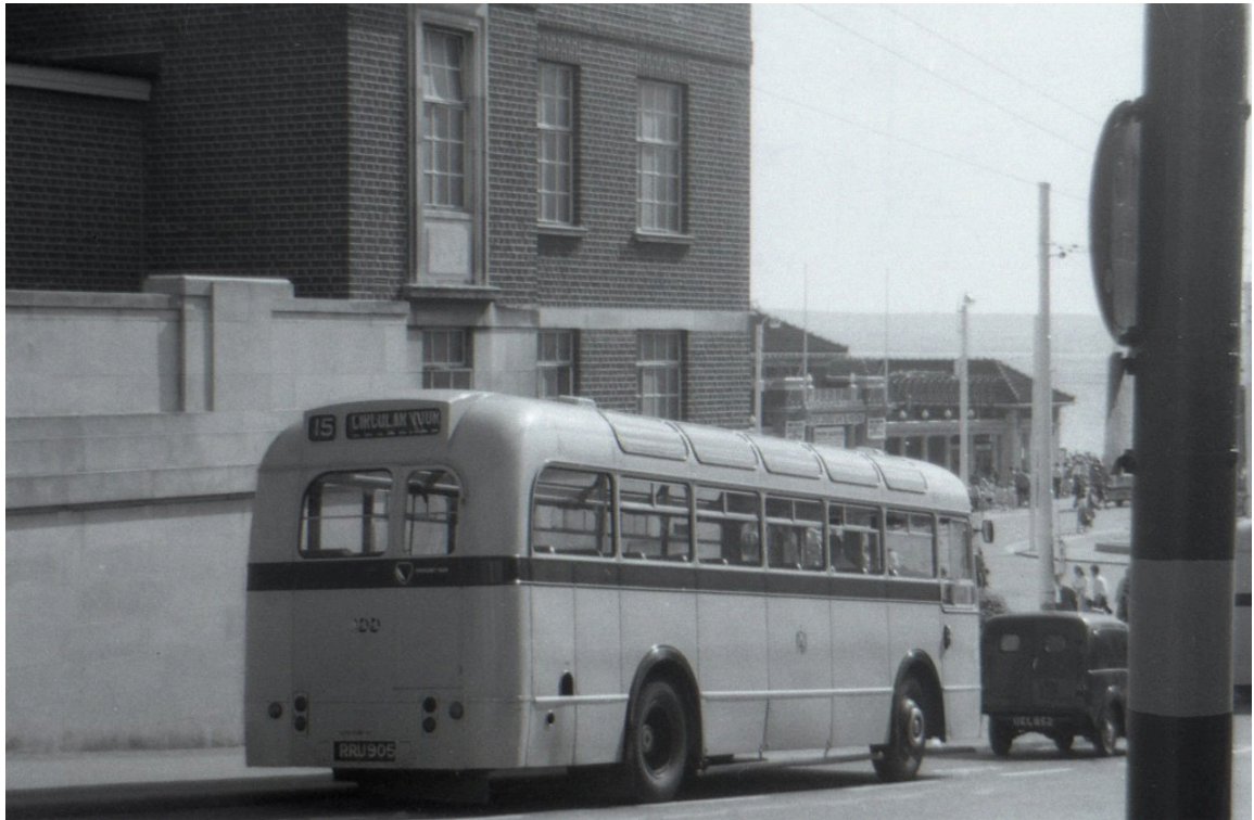
Boscombe Beach Bus c.1958

have been packed with excited children and holidaymakers heading for the beach.