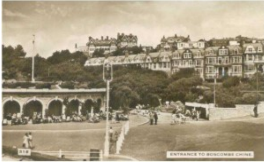
Boscombe Chine 1950's where the Beach Bus turned back to Christchurch