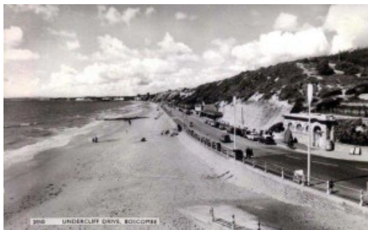
The Coast Road to Bournemouth, 1950's