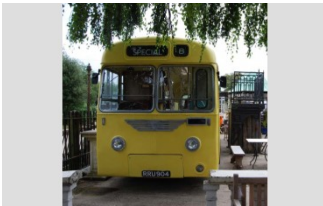
The Lily Langtry parked at LASSCO