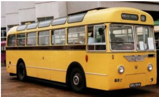
The Boscombe Bus at the Mallard Road Depot, Bournemouth