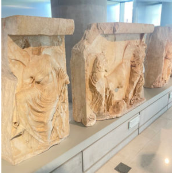
The marble original at the Athens Museum is 106.7cm high.