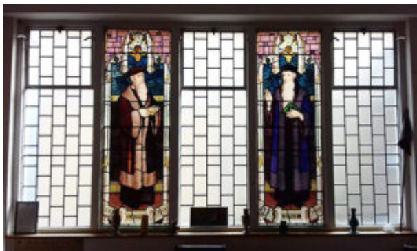
Calvin and Knox as installed at URC Derby

Two larger panels in the series, featuring Knox and Calvin, (also acquired by LASSCO click here ) were made in Nottingham by Andrew Stoddart at a similar time, originally for a different Derby church: The Green Lane Presbyterian Church. These two congregations were to merge as part of the Unification of 1972 – the creation of the United Reformed Church nationally. The windows from Green Lane were also united – and they were installed alongside the Victoria Street windows.