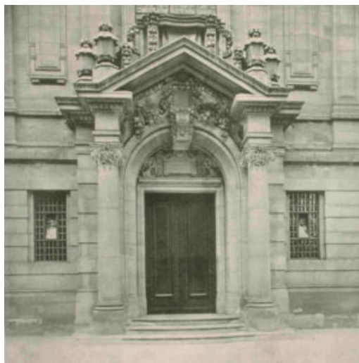
The Main Entrance to the Hall carved by Abraham Broadbent