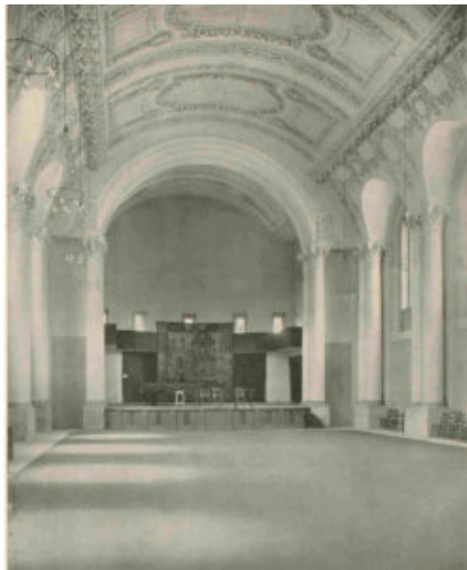
The Memorial Hall pictured in 1907