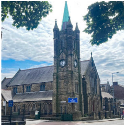
Thornhill Methodist Church, Sunderland, built c.1902-3