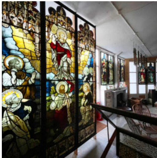
Stained glass on display at LASSCO Three Pigeons