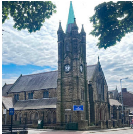
Thornhill Methodist Church, Sunderland, built c.1902-3