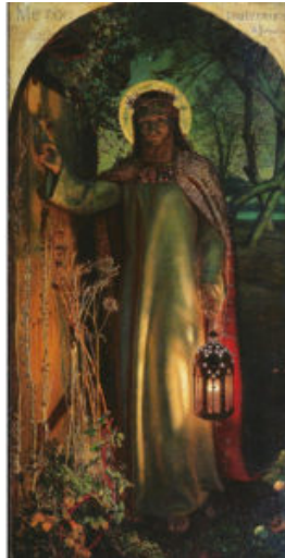
Holman Hunt's original

One of the two lights is a rendition of Holman Hunt's "The Light of the World". Hunt's oil painting, a pre-Raphaelite interpretation of Revelations 3:20 "Behold I stand at the door and knock...", had a clamorous reception in Victorian times (and he was to twice reproduce it subsequently). The original version, painted in the early 1850's, now hangs in the chapel at Keble College Oxford; it is said that Hunt found the correct light in the gardens of the Oxford University Press in order to paint it.