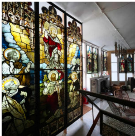
Stained glass on display at LASSCO Three Pigeons