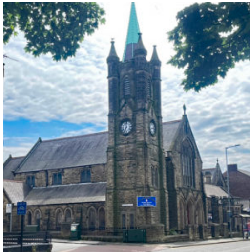
Thornhill Methodist Church, Sunderland, built c.1902-3

The Thornhill Methodist Church of Burn Park Road, Sunderland was built 1902-1903 by TR Millburn and JE Miller; it later became known as Burn Park Road Methodist Church and has now sold and has been de-consecrated. The Millburns went on to build the Empire Theatre in Sunderland.