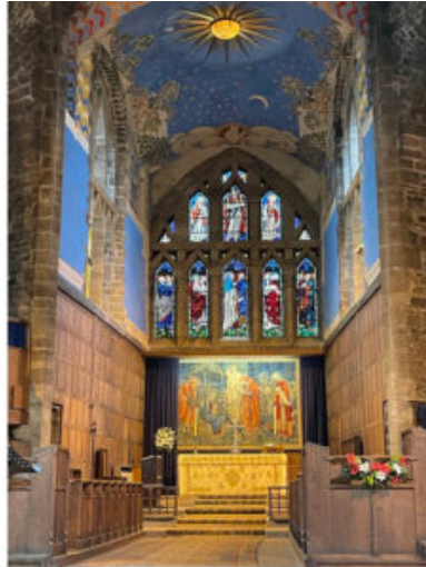
St Andrew's Church, Roker