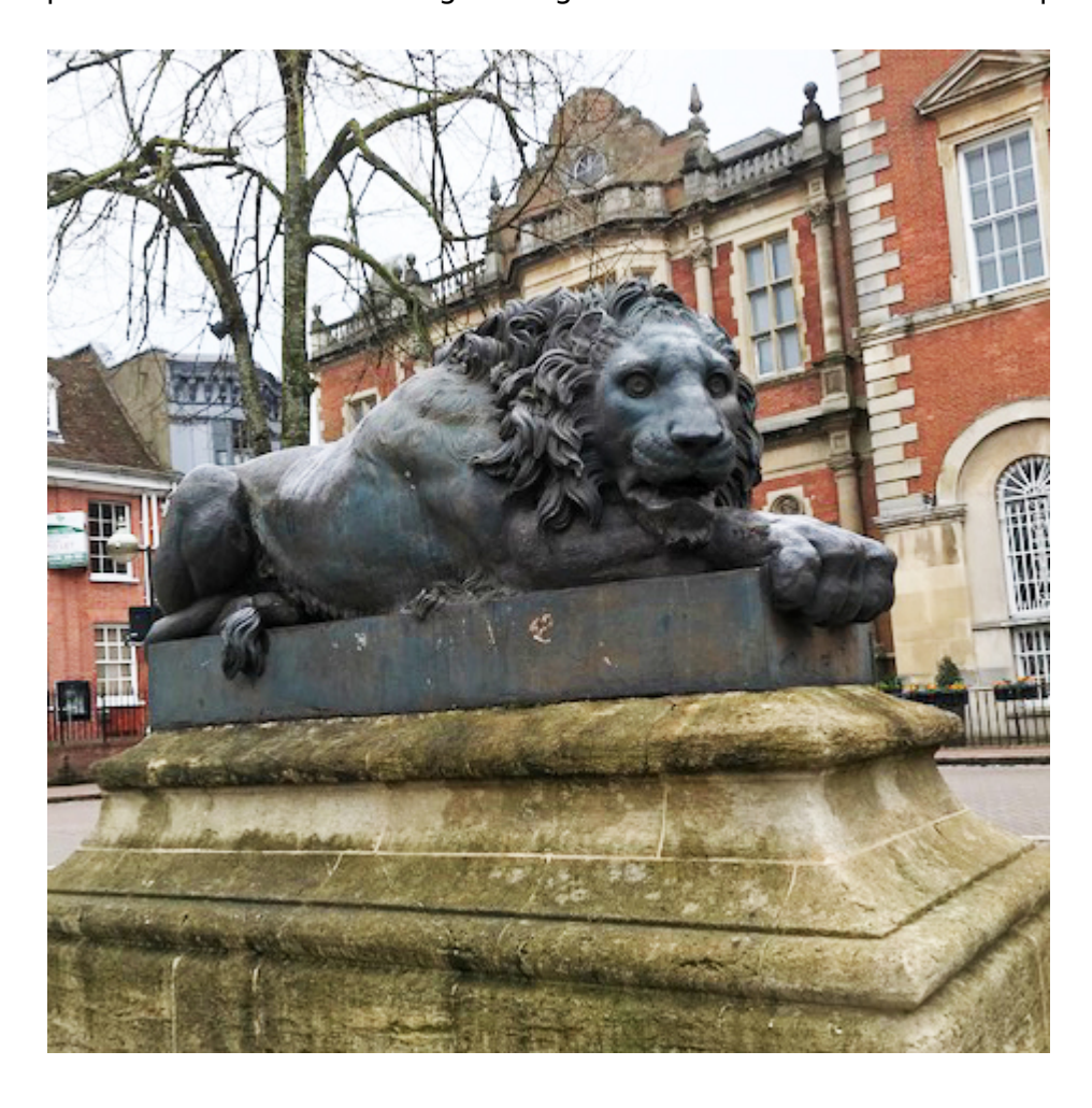
iron. A pair of these can be seen guarding the Town Hall in the Market Square, Aylesbury.